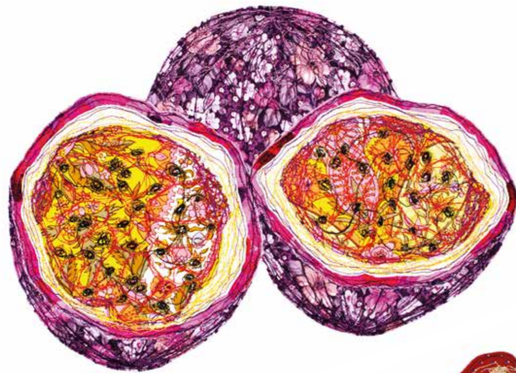
Clockwise from right: Pineapple; Tomato; Grapefruit; Watermelon; Chili Pepper; Passion Fruit. All made with fabric, thread, watercolour paper, 2018